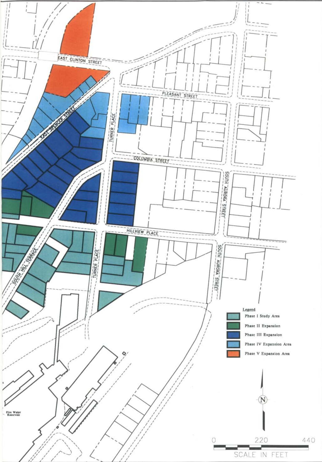
Figure 1 Expansion of Indoor Air Study Area - Phase V Emerson Power Transmission Ithaca, New York

11911 FREEDOM DRIVE SUITE 900 RESTON, VIRGINIA 20190 (703) 709-6500