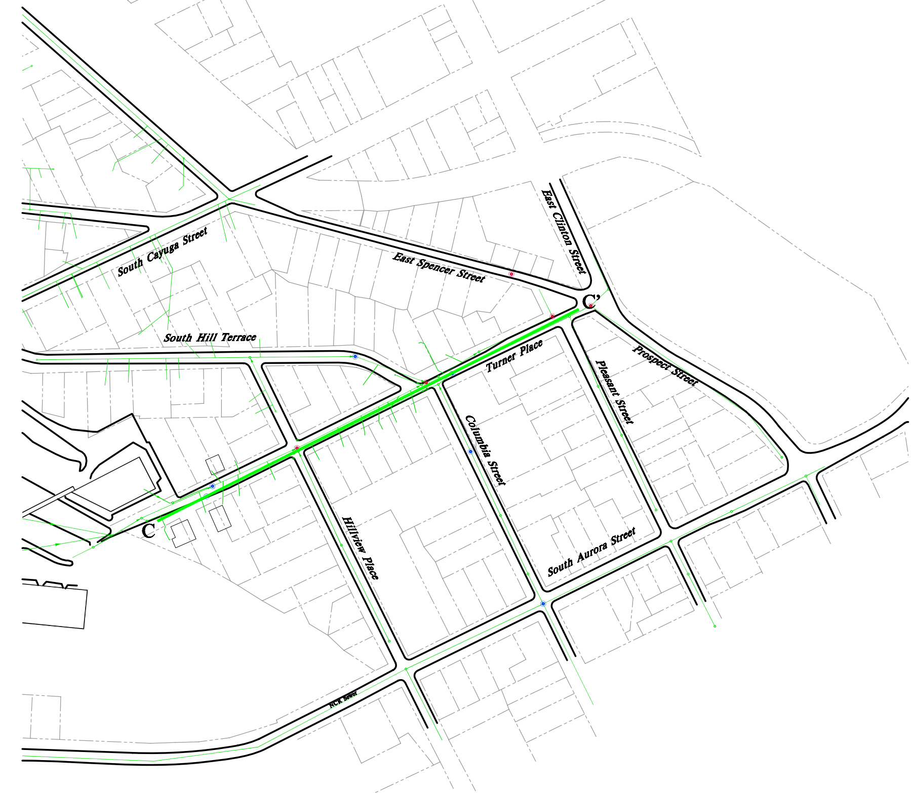
Section Location Not to Scale